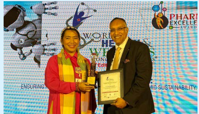
Topmost Healthcare Leaders Global award at Mumbai