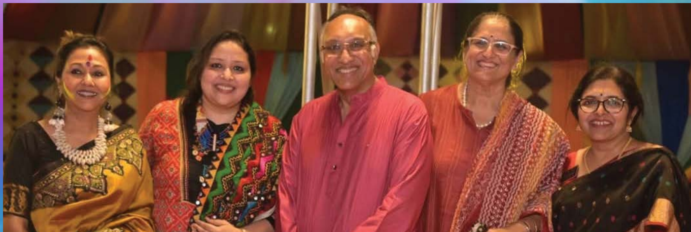
RANGOLI - District Holi Meet, held on Sunday 16th March 2025 at Eastern Metropolitan Club. RCCV was a Silver host club.